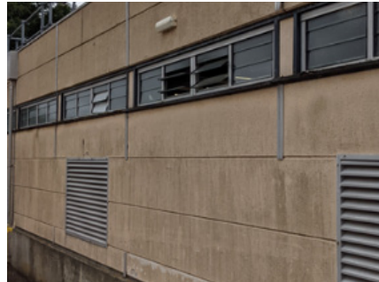
Figure 4: Example of RAAC in walls