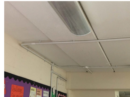
Figure 1010: Example of deflected RAAC panel

RAAC panels may bow or deflect. From the underside of the roof or floor you may see a 'gap' between two adjacent panels.