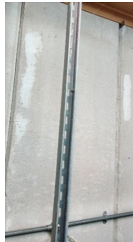
Figure 99: V-shaped grooves at 600mm spacing