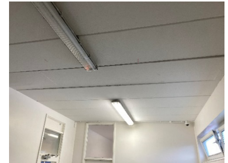
Figure 1111: Example of deflected RAAC panel