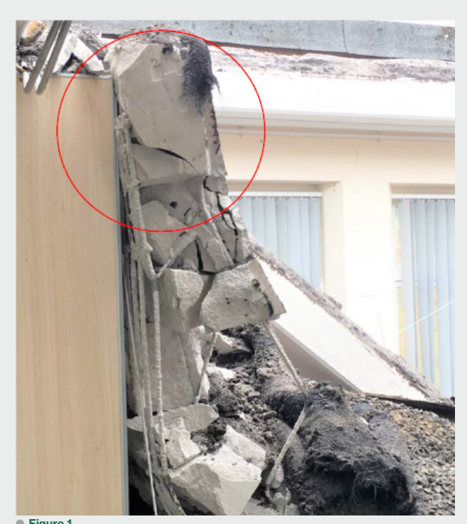
Figure 1 The 2018 roof slab collapse

In the 1980s there were many instances of failure of RAAC roof planks installed during the mid-1960s and a large proportion of such installations were subsequently demolished <sup>[1]</sup>. Several case studies revealed some primary deficiencies e.g. incorrect cover to the tension steel, high span-todepth ratio, insufficient provision of crossbars for providing anchorage for the longitudinal steel, failure in performance of roof membrane and rapid worsening of local corrosion of steel.